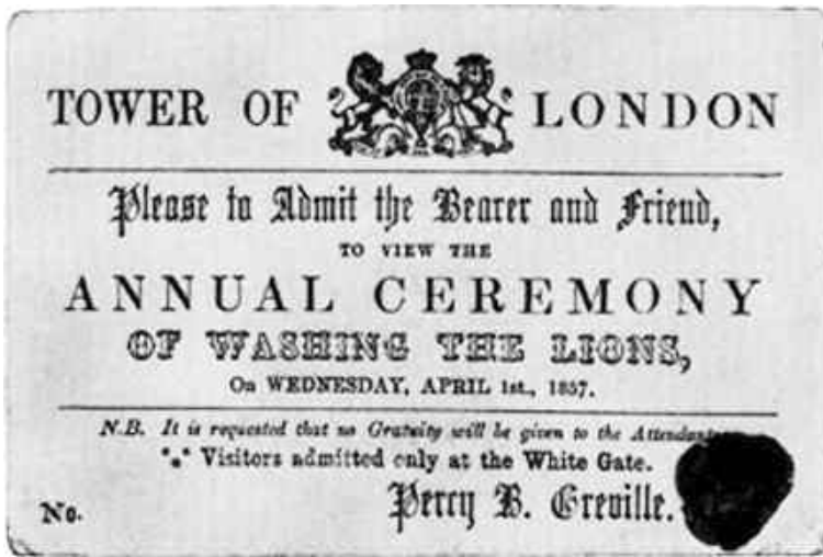
An old-time April Fools? This ticket to "Washing the Lions" at the Tower of London was an April 1 event that never took place.

One theory takes us back to the 1,500's when the Gregorian calendar was adopted after long following the Julian calendar. The Julian calendar referenced the spring vernal equinox (late March) as the start of the New Year. The Gregorian calendar moved the start of each year to January 1. The idea is that those who forgot this change, and still thought of spring as the start of the year, were April fools.